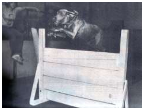
OTCPBC Achieve Picture

This picture is from the OTCPBC achieve. Dogs used to jump a LOT higher than they do now. At one time, a dog was required to jump 1 1/2 times his height. Then it was lowered to 1 1/4. Then to our current standard of the dog's height. In some breeds, it is now 3/4 their height for obedience.