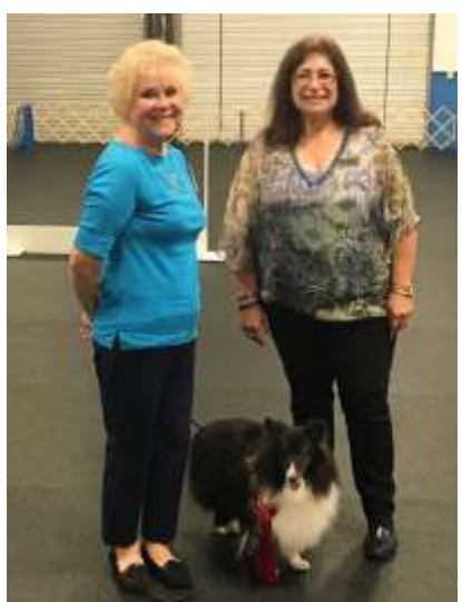
Simcos Midnight Dream UD RAE CGCA TKA

Working on leg 7 of UDX but only qualified in Utility B! Second place, I will take it! Proud of this old guy too! He is a little work machine!