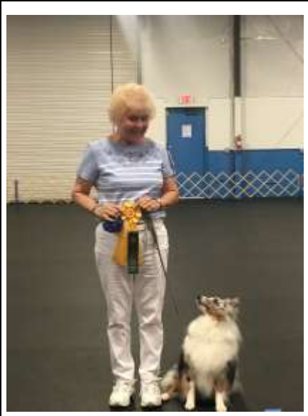
Sta-A-Bit Dreamchaser Denim Blue, BN RE First CD leg with a score of 194 and 3rd Place at the OTCPBC Obedience Trial on

8/29/18. Very proud of this very shy boy!