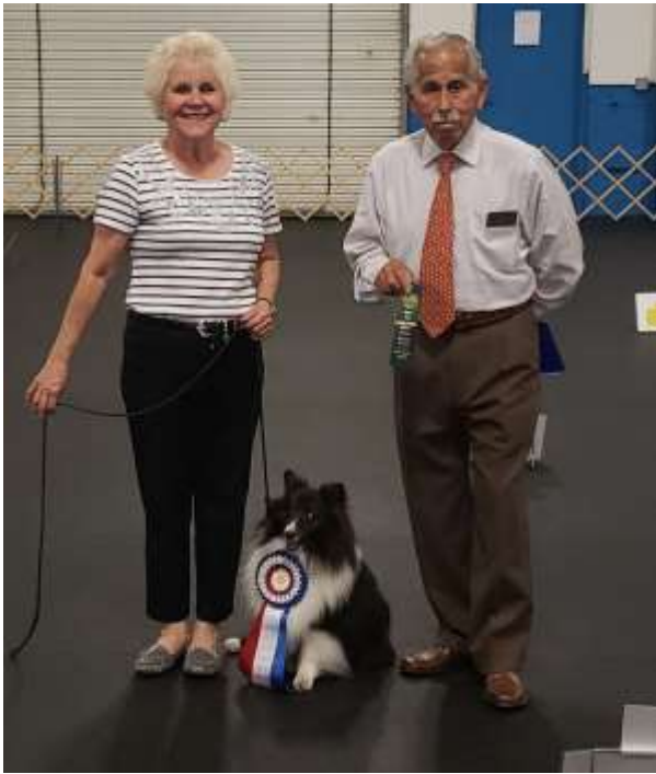
Simcos Midnight Dream UD, RAE, CGCA, TKA

Completed qualifying at ten shows for his Rally Master Title at our November 10th and 11th Rally Show.