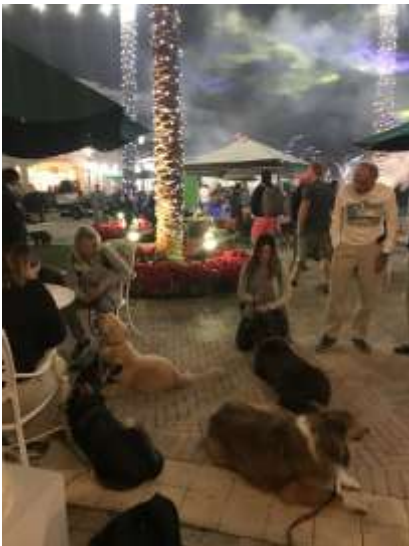
Our Urban CGC class had a real test of appropriate reactions to urban life when we trained at City Place during the Hanukkah Festival of Lights.