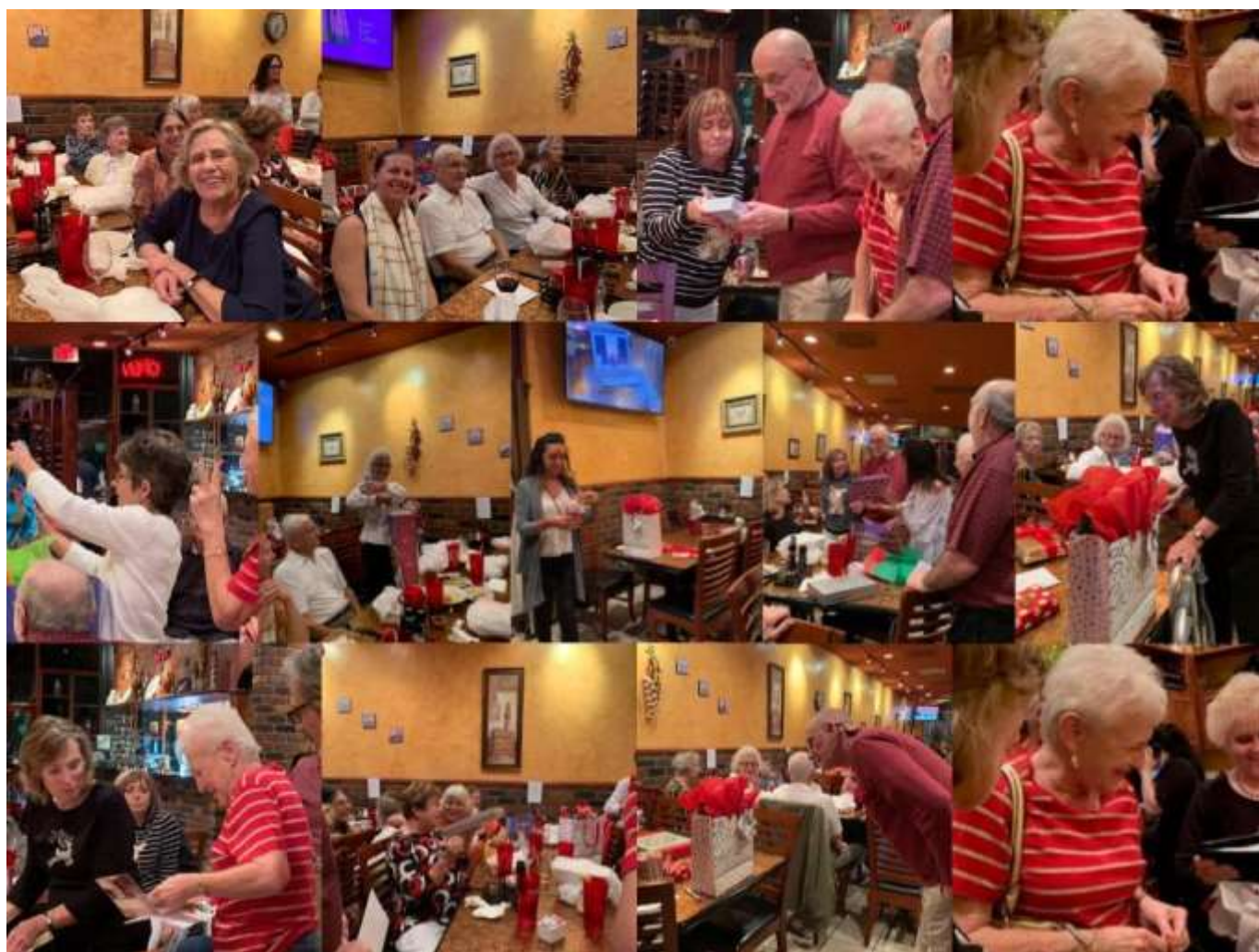
The Obedience training Club of Palm Beach County Holiday party at Buongiorno's. Take a number, pick a gift, and hope no one "steals" that great gift from you.