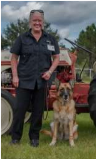
Kona received her Farm Dog title! CGCFD We had fun!