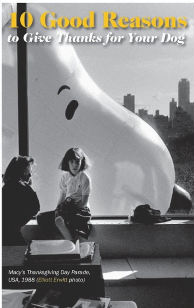
Macy's Thanksgiving Day Parade, USA, 1988