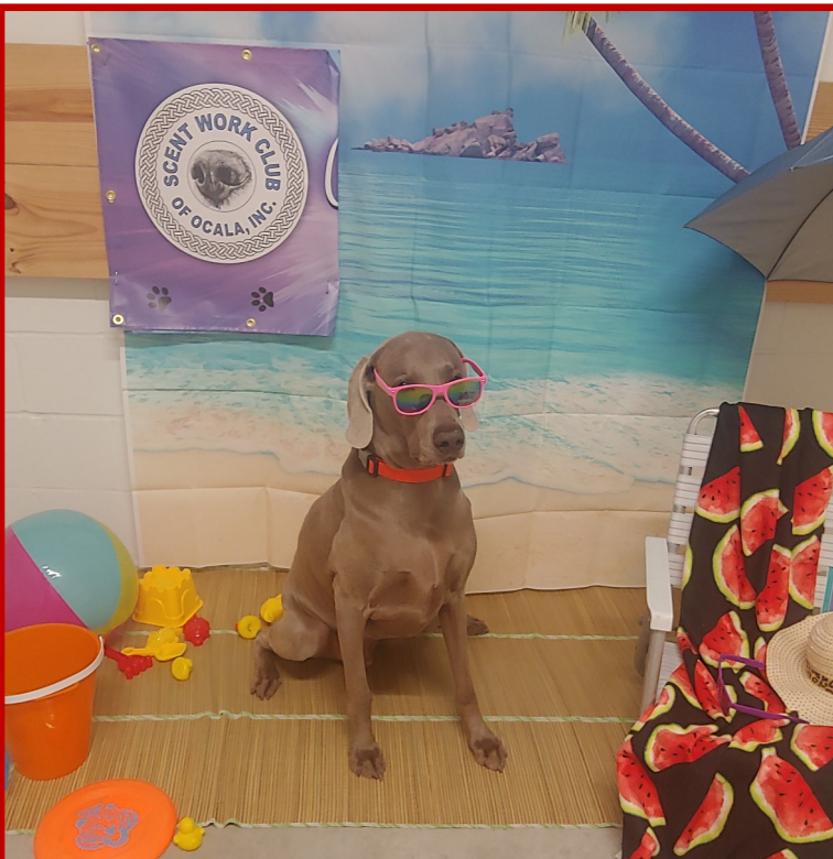
Astro earned Detective legs #6 & #7 at the Ocala Scent Work trials in June and showed he was a cool Dude at their photo op.