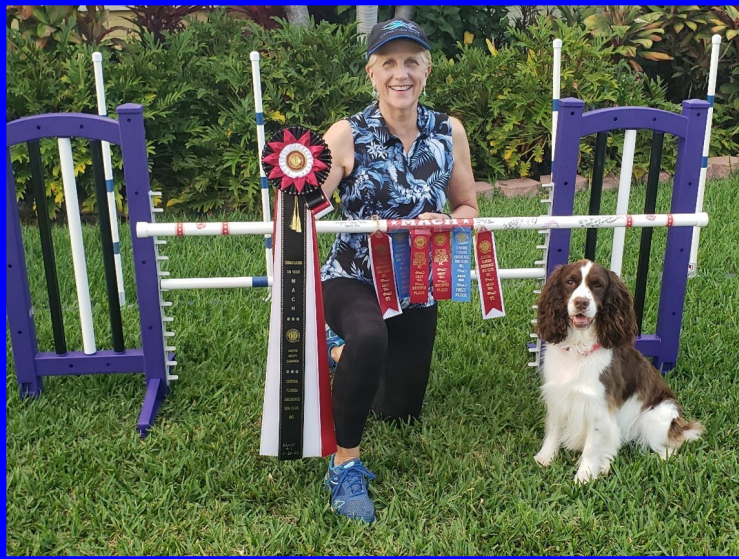
Mach Abaco's Island Girl "Abby"